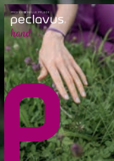
peclavus® hand Natural care for beautiful hands

Available exclusively from selected consultants.