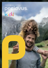
peclavus® kids Mild kids care made fun