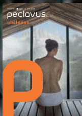
peclavus® wellness Well-being for body and soul