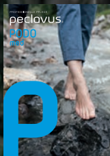
peclavus® PODOmed Effective alleviation of foot problems