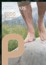
peclavus® PODOdiabetic Gentle care for sensitive feet